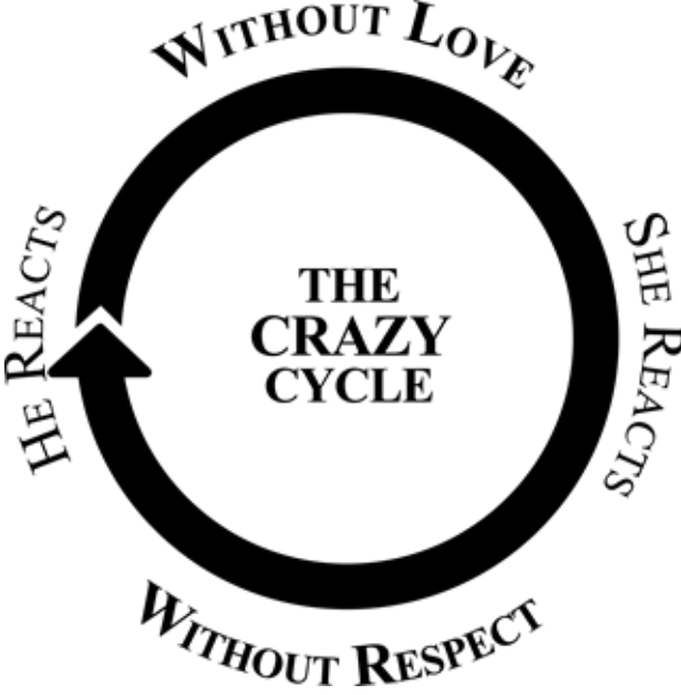
The Crazy Cycle